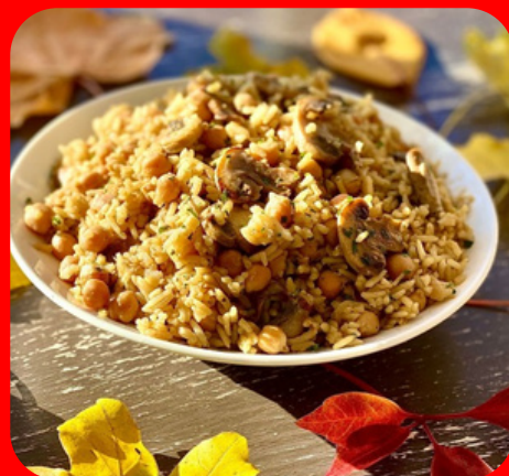
MIDDLE EASTERN PILAF