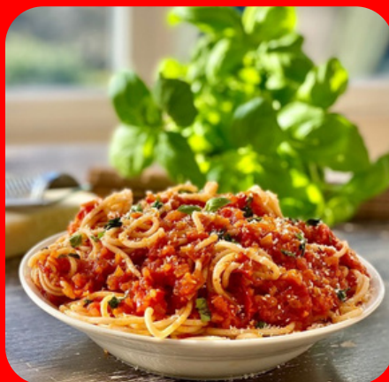
ITALIAN PASTA SAUCE