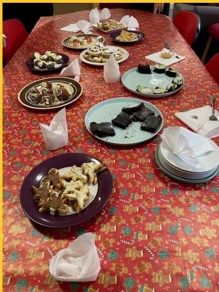
Students in our Redworth Center showing off their culinary skills