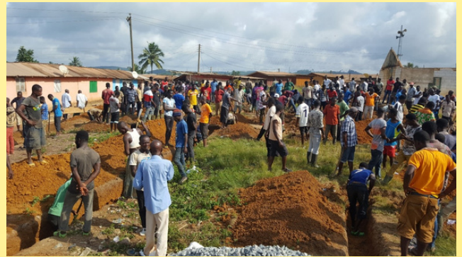
Breaking the ground for the start of the ERC project with the help and support from the chiefs and people of villages in Ghana