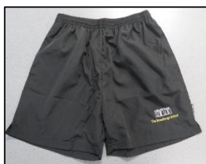
Item No K986 Jnr/Snr PE Shorts (Cooltex)