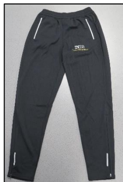
Item No 111885 Training Pants