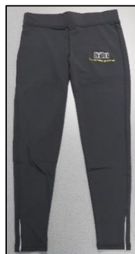
Item No 111888 Black Leggings