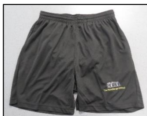
Item No JC080/B Light Material PE Shorts