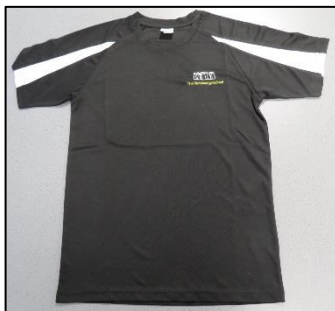
Item No JC003/JC003B Performance PE Top