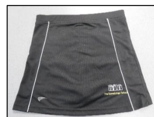
GIRLS ONLY Item No ZR60 Girls Black Skort