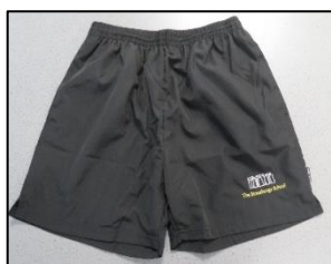
Item No K986 Jnr/Snr PE Shorts (Cooltex)