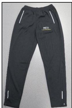
Item No 111885 Training Pants