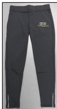
Item No 111888 Black Leggings