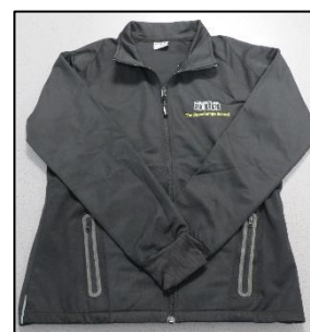
Item No 111895 Full-Zip Training Top

What about..... shorts for the summer and trousers or leggings for the winter?