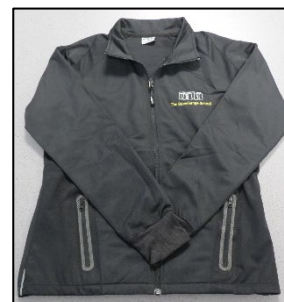
Item No 111895 Full-Zip Training Top

What about..... shorts for the summer and trousers or leggings for the winter?