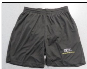
Item No JC080/B Light Material PE Shorts