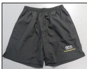
Item No K986 Jnr/Snr PE Shorts (Cooltex)