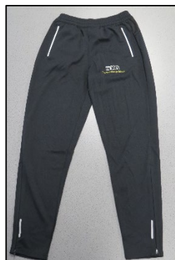
Item No 111885 Training Pants