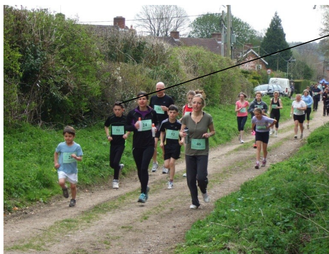
That is Me