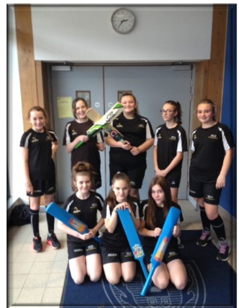
Year 7/8 girls Team

Our bowlers bowled well considering some of them only learnt how to bowl a few weeks earlier. Unfortunately Trafalgar hit four runs off the last ball which meant they won by four runs.